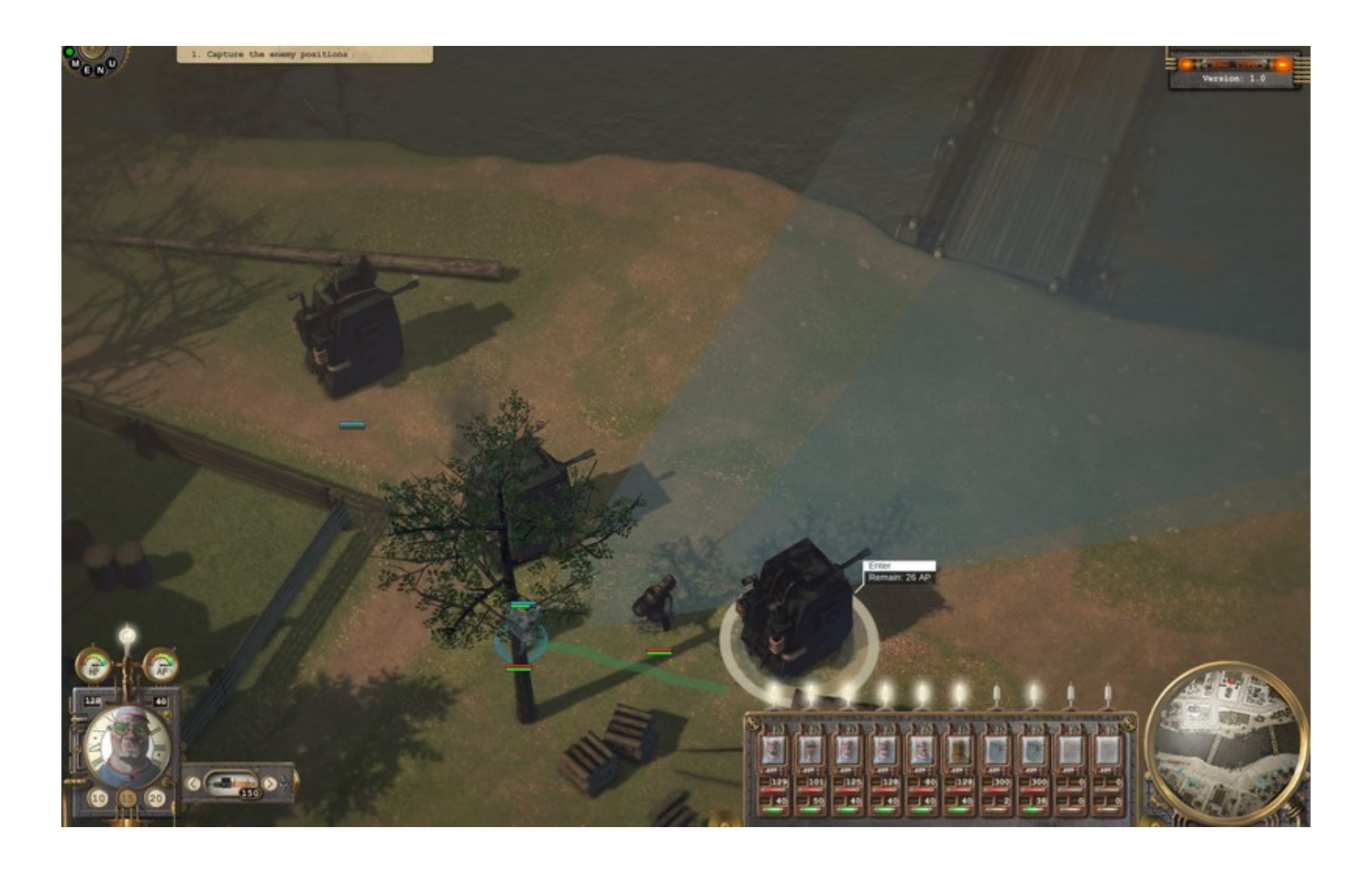
DragonScales 5: The Frozen Tomb Download 2gb Ram